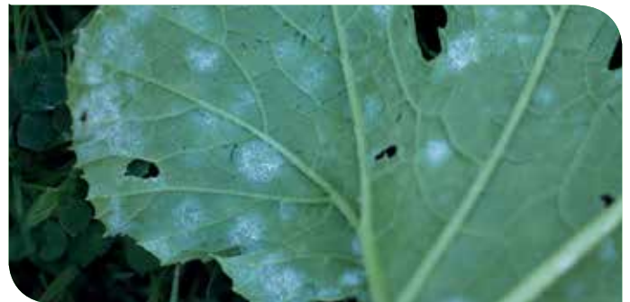
Powdery mildew infection on the underside of a cucurbit leaf.