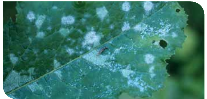
Powdery mildew infection on the top surface of a cucurbit leaf.